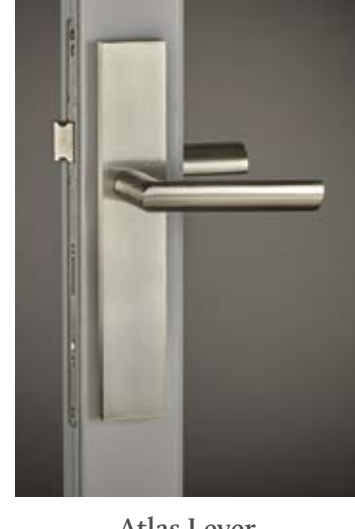
Atlas Lever (shown with City backplate in Satin Nickel)