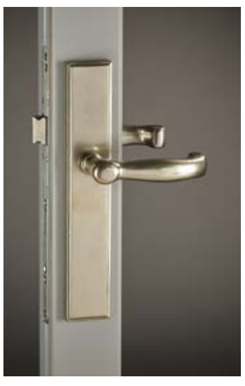
Hampton Lever (shown with Rectangular backplate in White Bronze*†)