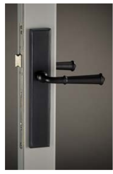
Colonial Lever (shown with Rectangular backplate in Matte Black<sup>†</sup>)