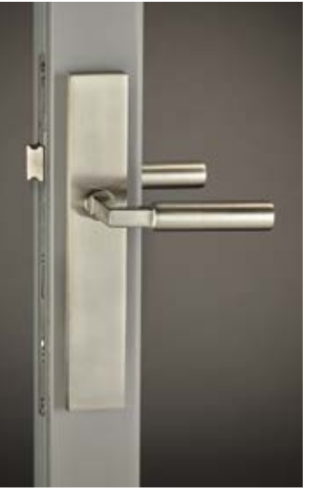
Bauhaus Lever (shown with City backplate in Satin Nickel)