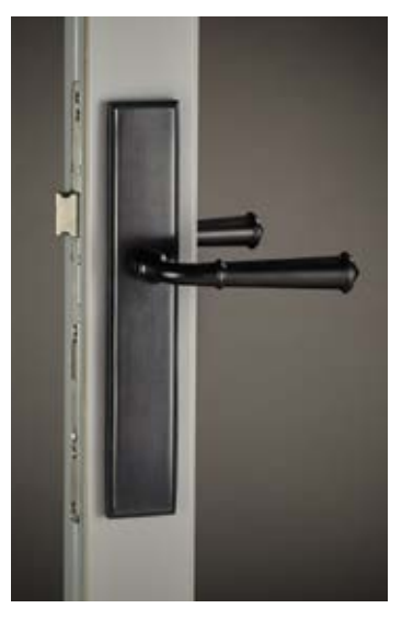
Colonial Lever (shown with Rectangular backplate in Dark Oil Rubbed*)