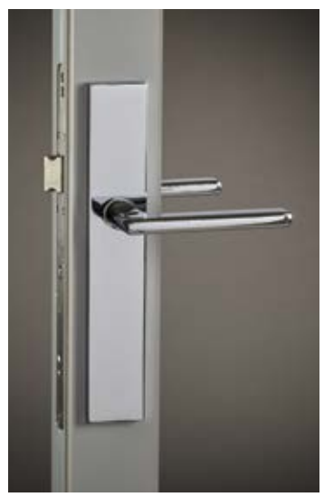
Apollo Lever (shown with City backplate in Polished Chrome)