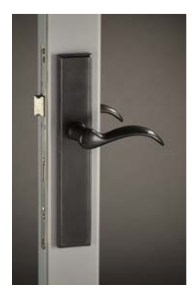
Churchill Lever (shown with Rectangular backplate in Dark Bronze*†)