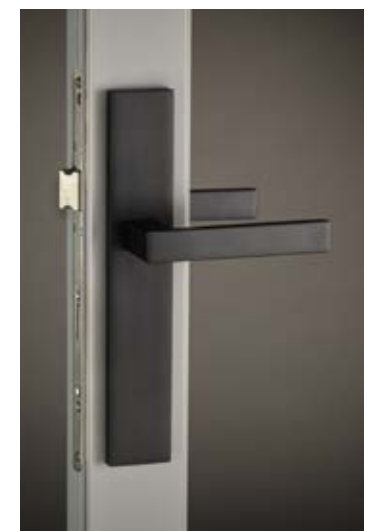
Meridian Lever (shown with City backplate in Flat Black)

Solid brass keyed handle sets with multi-point locks are available with a choice of two backplates: City (square) and Rectangular (beveled). Lever styles include: Meridian, Apollo, Atlas, Chester, Bauhaus and Colonial, and are interchangeable with brass backplates. Available in four finishes. Some combinations of levers, backplates and finishes are shown below.