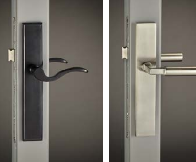
Chester Lever (shown with Rectangular backplate in Dark Oil Rubbed*)