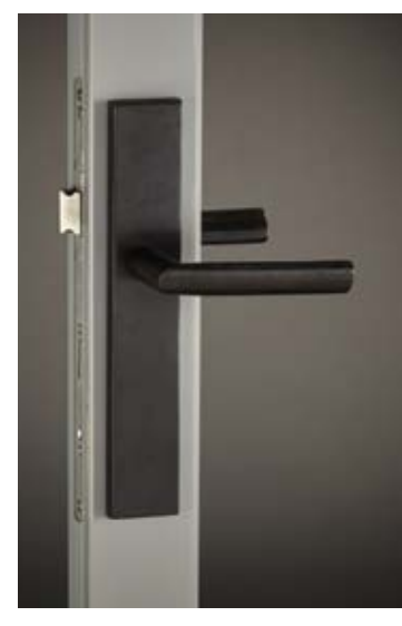
Atlas Lever (shown with Urban backplate in Dark Bronze*†)