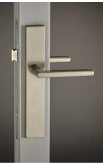
Apollo Lever (shown with Urban backplate in White Bronze *†)