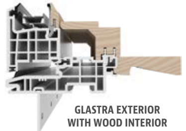
GLASTRA EXTERIOR WITH WOOD INTERIOR

SEE THE STRENGTH OF FORGENT SERIES AT KOLBEWINDOWS.COM/GLASTRA