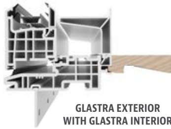
GLASTRA EXTERIOR WITH GLASTRA INTERIOR

Forgent Series products are comprised of Glastra, a proprietary hybrid of fiberglass and UV stable polymer, formulated for strength and resilience. To suit various performance requirements, a Glastra exterior and a choice of Glastra or Wood interior is available in select colors and finishes.