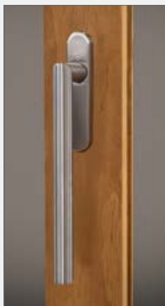
Amsterdam – Shown in Stainless Steel