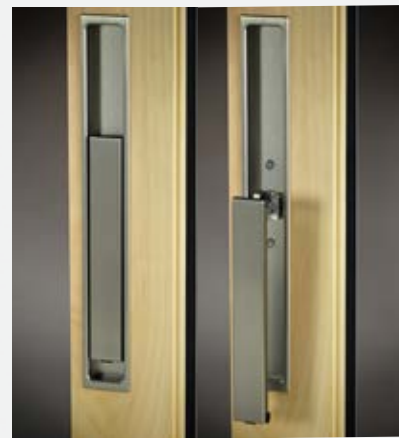
180° Inset Handle – Shown in Silver (Also available in Matte Black & Rustic Umber)

Printed images of hardware finishes will vary from actual colors. Not all hardware colors are available for all hardware options. Limitations may apply. Selections should be made based on color samples available from your Kolbe dealer.