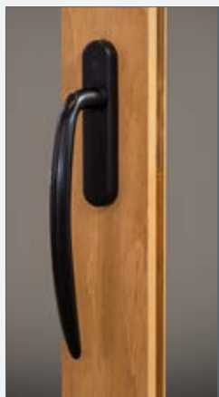
Atlanta – Shown in Matte Black