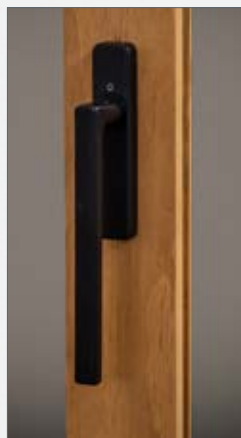
Dallas – Shown in Matte Black (Also available in Satin Nickel & Rustic Umber)

All configurations are offered with a choice of lever styles or a 180° Inset Handle with a flush pull. Choose from interior lever style handles with an exterior pull, or pair up the Dallas interior handle with a coordinating Dallas exterior handle.